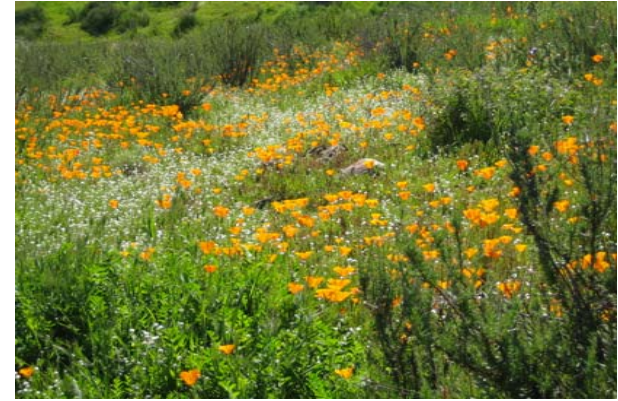
Native sage scrub habitat in the spring