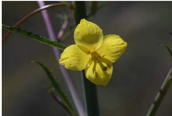
California sun cup, a native wildflower

During the spring, the hills within the HCA are blanketed with beautiful wildflowers. The wildflowers include poppies, goldfields, pin cushions, lupines, bluebells, popcorn flowers, and tidy tips, to name just a few.