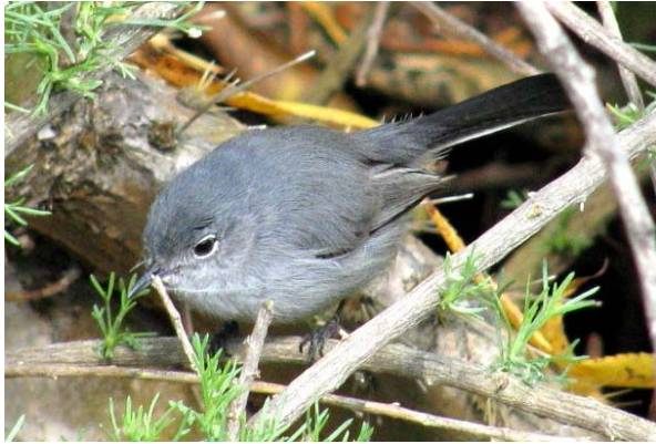
California gnatcatcher (female)

The Summerhill Habitat Conservation Area (HCA) consists of 113 acres in the City of Lake Elsinore, CA. The HCA or preserve is covered almost exclusively in sage scrub. This is the preferred habitat of the California gnatcatcher and other rare birds.